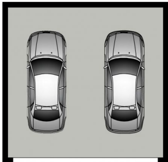
LOCK-UP GARAGE 6.0 x 5.8