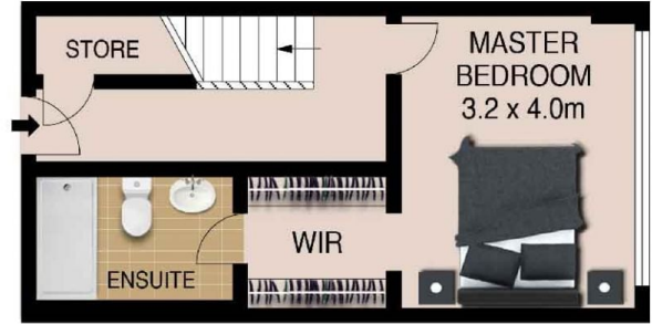
GROUND LEVEL THREE