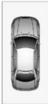
SECURE CARSPACE 2.5 x 5.5