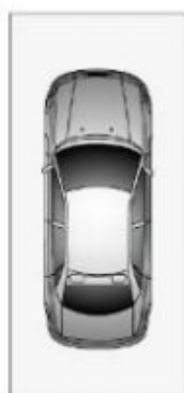
SECURE CARSPACE 2.5 x 5.5