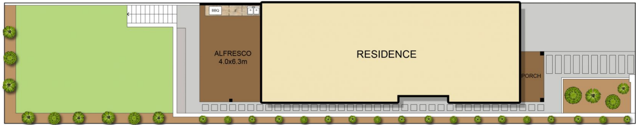
S I T E P L A N