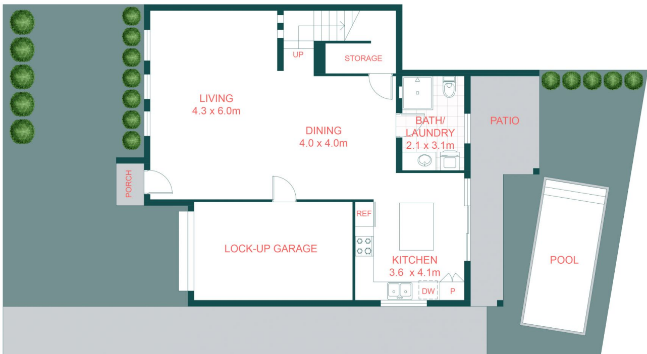
GROUND FLOOR PLAN ON SITE PLAN